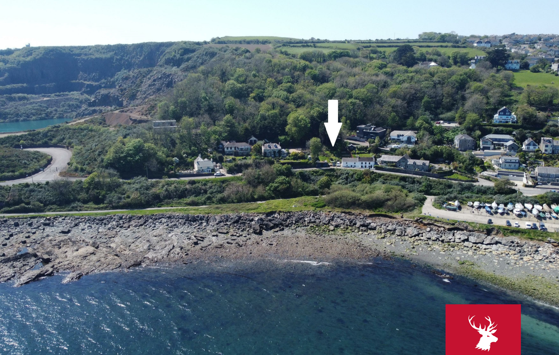
Plot - Sandy Cove, Fore Street